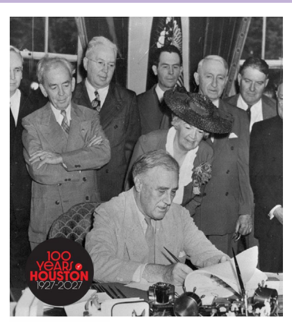
WATCH THE EPISODE ON HOUSTONPUBLICMEDIA.ORG

The impact of World War II, veterans and the GI Bill of Rights on the new campus of the University of Houston was tremendous. The War caused a major decline in enrollment as students joined the armed services or worked in industry. The leadership of UH worked closely with the US military to support the war effort. Returning veterans created unprecedented growth and change in enrollment and facilities paving the way for UH to become a major university.